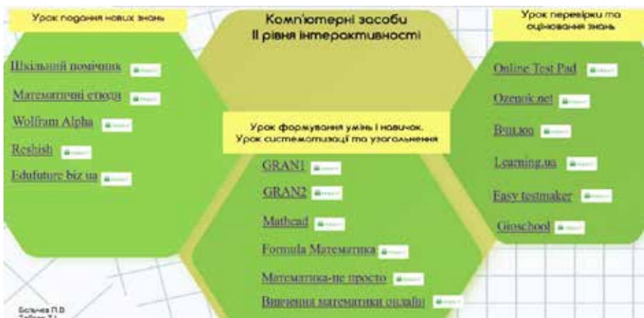
Fig. 2. Level II Interactive Computer Tools